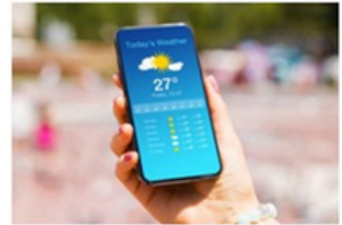
Pictured: A warm, sunny day on a weather app.

In parts of Northern Europe, April is known for its showers. One minute it's raining, the next the sun is shining! But what if a weather app on a phone makes it look wetter than it really is? Some popular places to visit, including Chester Zoo, say this is happening. They say a simple rain cloud symbol on a phone can make it seem like the whole day will be rainy, even if it is only a short early morning shower. This can sometimes lead to families changing their plans and staying at home. For places like zoos, theme parks and gardens, this can make a