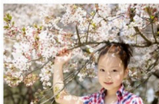
Pictured: A child with cherry blossom.

What other signs of spring have you seen?