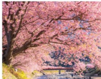
Pictured: Kawazu cherry trees in bloom.

Many people have been sharing their photos of Japan's famous cherry blossoms in full bloom. Cherry blossom plays a large role in Japanese culture, symbolising renewal and hope and showing a visual sign that spring has truly arrived. The blossoms (called sakura ) appear in late March and April, and have inspired art, poetry, and festivals for many years! During the spring season, families and friends get together in parks and gardens to have picnics or parties while appreciating the flowering trees.