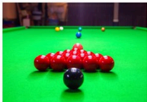
Picture: Snooker balls on the table at the start of a game.

Seven-time snooker world champion Ronnie O'Sullivan, known as 'The Rocket', is trying something new! For the first time ever, he's set to play in the World Seniors Snooker Championship this May at the famous Crucible Theatre in Sheffield, England. The tournament is open to players aged 45 and over and brings experienced competitors back to the table. There are 22 balls in a game of snooker: 15 red ones, six coloured balls (including the black, worth the most points!) and one white cue ball. Players use a long wooden cue (about as tall as an adult) to strike the balls across a huge 12-foot table. The table isn't wood inside! It's made