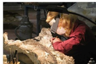
Picture: Palaeontologist working on a dinosaur fossil.