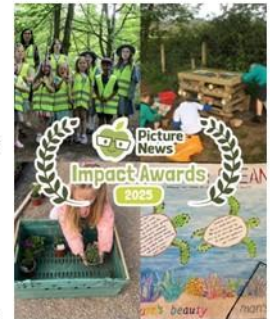
Pictured: Schools making an impact.

There is still time for your school to apply to our very special Impact Awards! It's a great opportunity to showcase the positive actions you have taken in response to what's happening in the world around you. The Picture News Impact Awards celebrate the incredible ways children, schools, and communities are making a real difference.