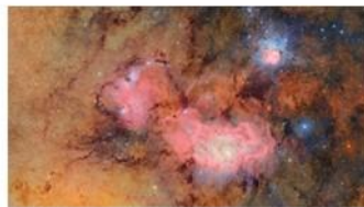
Pictured: Image of the Trifid and Lagoon nebulae.

Scientists say the first images from the largest digital camera ever built have provided a 'peek of the cosmos'! The 3200-megapixel images are from the world's newest and most powerful survey telescope! The NSF-DOE Vera C. Rubin Observatory team have begun their ten-year project, during which they aim to capture the cosmos in exquisite detail. The telescope has been built on a mountain in the Andes, in Chile. This special location was chosen as it has dry air and dark skies, which make it the