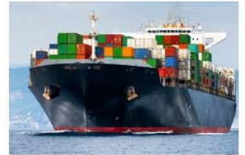
Pictured: A cargo ship in the sea, not on land!

Did you know some cargo ships travel for weeks or months without stopping?