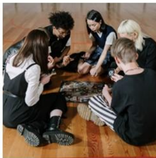
Pictured: Playing a board game.

The world's first public 'Offline Zone' has opened in a busy train station in the Netherlands. It's a space for people to enjoy each other's company and partake in activities that do not involve the internet, such as chatting, reading, and playing board games. The initiative is a collaboration between The Offline Club and health insurer, Zilveren Kruis, who believe the space will improve the mental health of people visiting the zone. Dutch social movement, The Offline Club, is creating and promoting screen-free public spaces and events, encouraging people to meet for screen-free fun. It also hosts digital detox retreats, for guests to unplug completely from the internet.