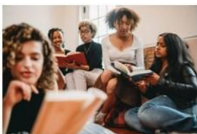
Pictured: Book club.

Do you enjoy playing board games or reading books with friends?