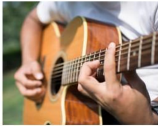
Pictured: An acoustic guitar.